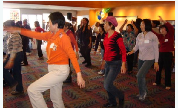
三藩市總醫院的社區健康中心於 2011 年七月十五日隆重開幕，很多人參加其舉辦的免費太極班。

在安裝起重機之後，我們可以開始三次大規模的倒入混凝土，第一次將於九月初進行。在二十個小時內將倒入六千立方碼的混凝土。為避免影響日間的交通和醫院的運作，倒入工程將於晚間進行。塔燈將照耀地盤。載混凝土的貨車將連續不絕的出入地盤，運來材料供四個大型混凝土泵用。