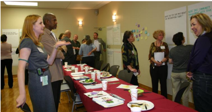
The first Community Engagement Initiative input meeting took place at the hospital this fall.

The first step is through the hospital’s Community Engagement Initiative. We seek to bring our patients, families and community members to the table as we look for ways to improve the patient experience, engage with the Rebuild project and help shape the Community Wellness Program to reflect the diverse communities we serve.