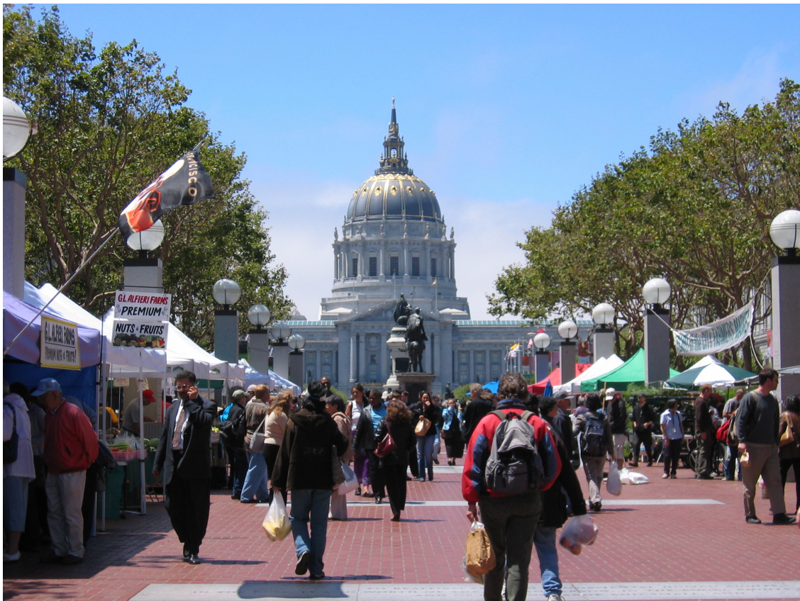
Heart of City Farmer Market