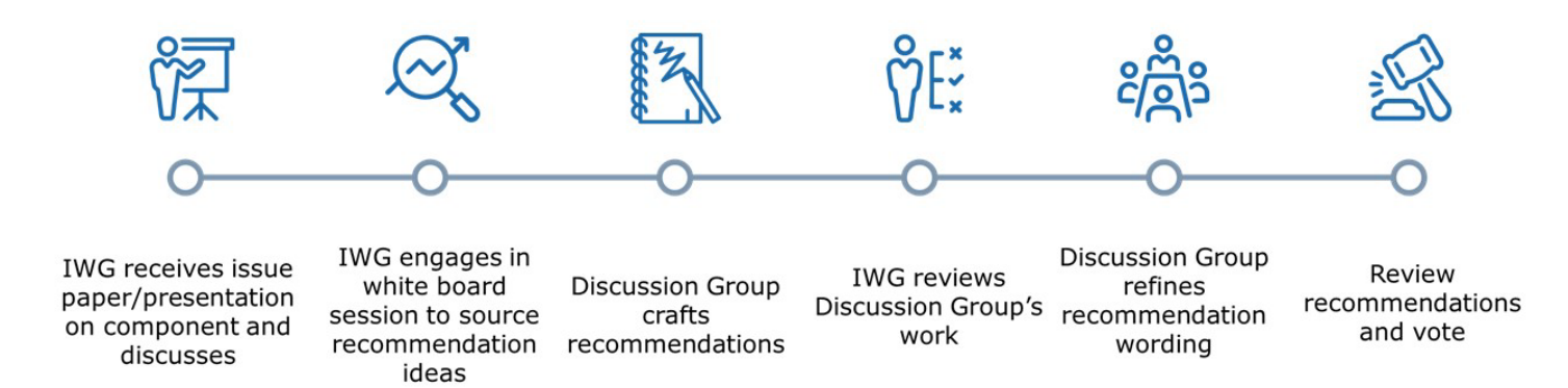
Figure 5: The IWG Recommendation Development Process

Once recommendations are approved, they are routed to the appropriate DPH team for review and consideration as the components are developed, implemented, and refined. DPH teams are asked to report back to the IWG about other implementation updates regarding the status of IWG recommendations. We anticipate that during future scheduled update sessions, new recommendations may be considered, and DPH may ask new questions for advisement by the IWG.