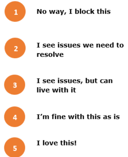
Figure 7: Gradients of Agreement

If after two discussion rounds and votes, there is not a level consensus for all members that votes of 3-5 (i.e., I see issues, but can live with it , I’m fine with this as is , or I love this! ), the IWG will use a simple majority yes/no vote. All concerns, considerations, and dissenting views will be recorded to ensure dissenting perspectives are shared alongside IWG recommendations.