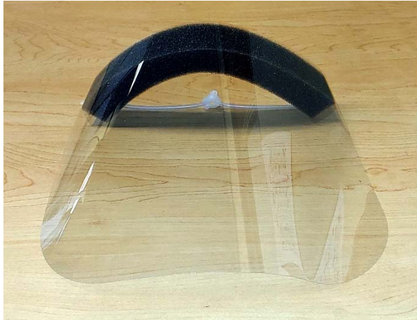
Healthcare face shield shown, impact resistant industrial Face Shields also acceptable