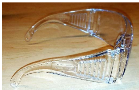
Rigid, impact resistant plastic