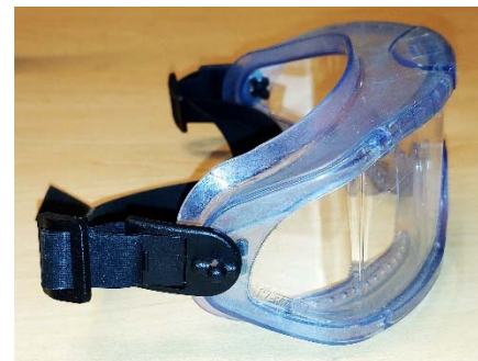
Flexible surround forms seal against face

For general patient care activities without splash or spray risks and when AGPs not being performed